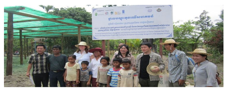
COMDEKS - Donor Visit