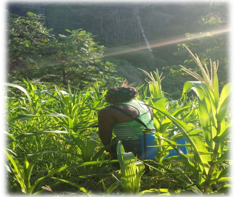
Organic Pesticides used on the farm

Organic pesticides made from household products