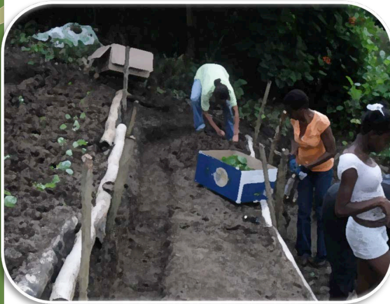
Terracing to reduce erosion