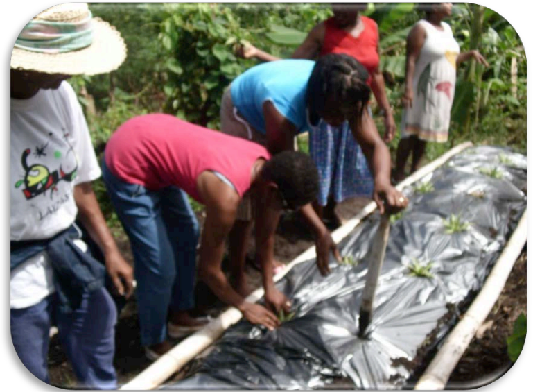
Using plastics to control weeds