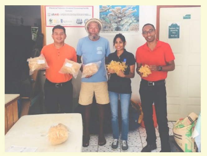
South-South Exchange in Belize