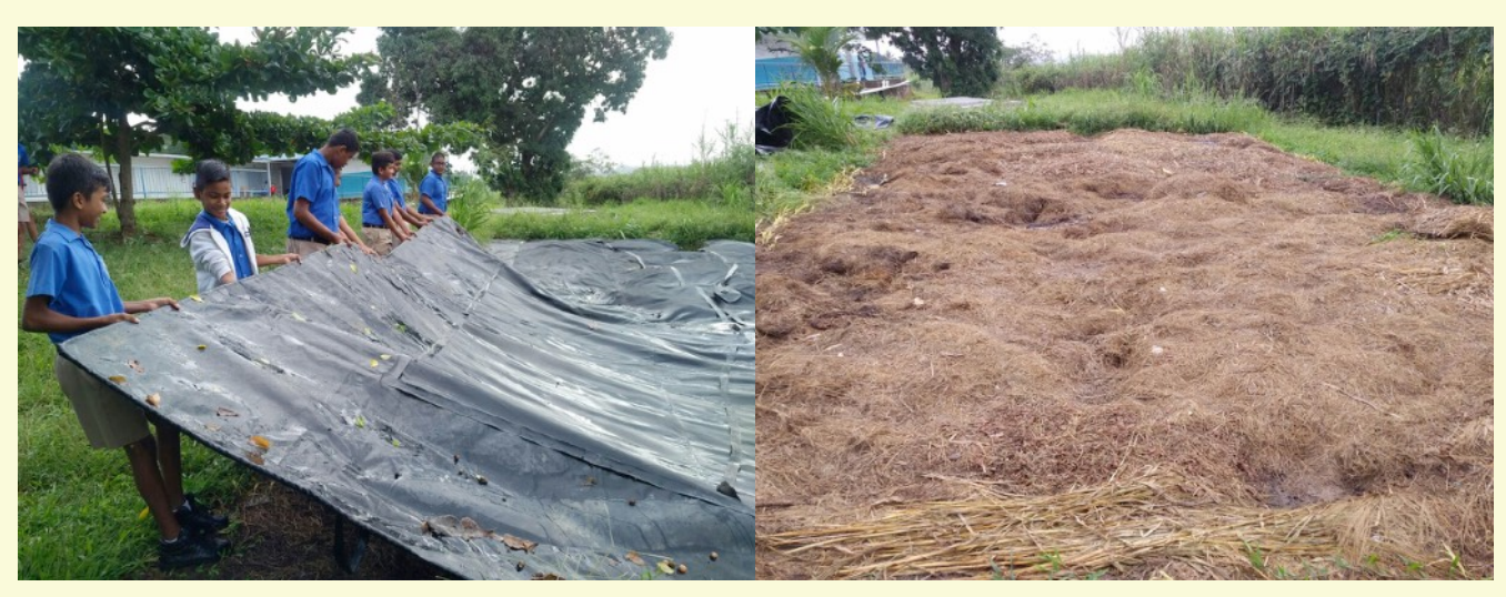
Spring Village Council Composting Project