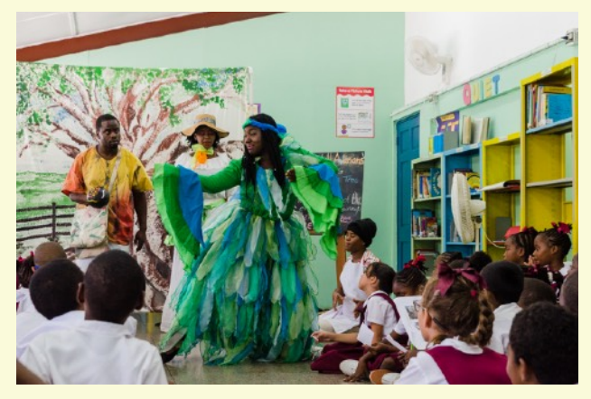
Arts in Action Biodiversity Awareness Project