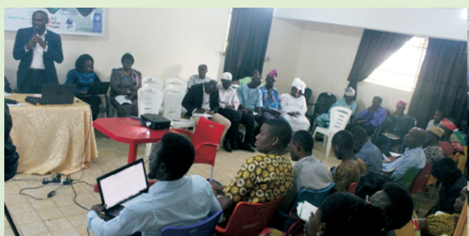
Cross section of participants and stakeholders at the carbon training workshop held in Ibadan Oyo State.

The facilitators mentioned that the set of trainees happens to be the first to be trained in this regard. At the end of the workshop, the participants pledged to embrace carbon farming.