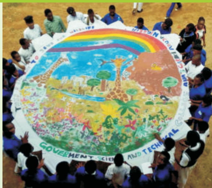
Winner Parachute on display in Washington DC, produced by Eco Club of Government Science and Technical School Area 3 Garki Abuja

https://motherearthproject.org/parachute details/? parachute_id=MTM1