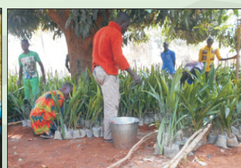
OFUD training project beneficiaries in nursery management and transplanting