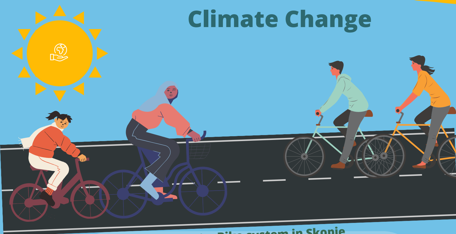
First Rent a Bike system in Skopje