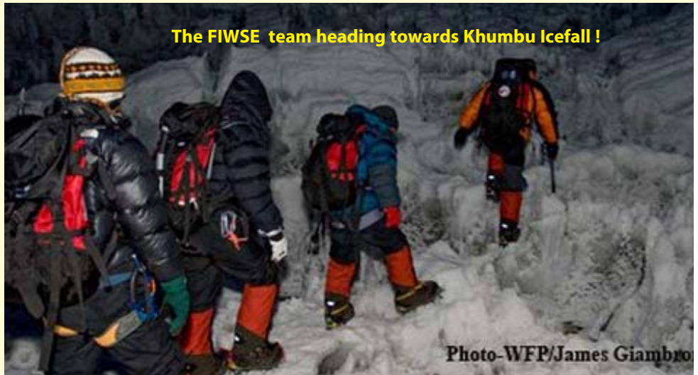
The FIWSE team heading towards Khumbu Icefall !

The team includes ten Nepali women, from 17-27 years-old, representing a range of the country's castes and ethnicities. This is the first time that women from the Brahmin, Chettri, Danuwar, and Gurung communities have summited Mount Everest. Out of the ten women, only two had prior mountaineering experience. Before this expedition, seven Nepali women had scaled the world's highest peak.