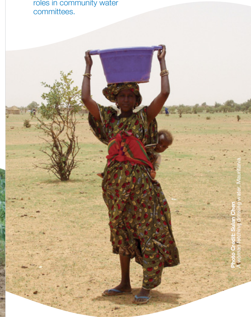
A woman fetching drinking water, Mauritania.

CWI aims to support poor and marginalized populations to acquire one of the most basic human needs - water supply and sanitation. It not only benefits women and children whose lives and health are impacted most adversely by the lack of accessible clean water and sanitation and the burden of fetching water over long distances. It also highlights women's knowledge and responsibilities as managers of water at the household level and their potential roles in community water committees.