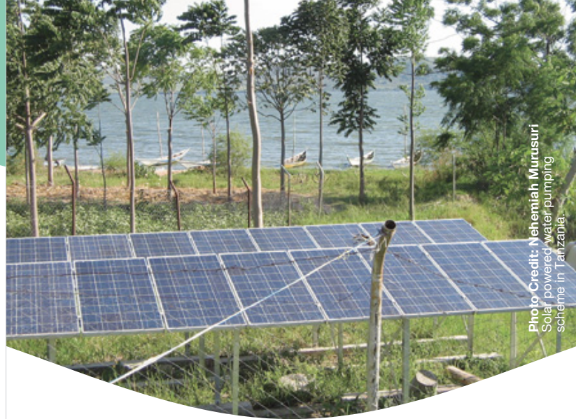
Solar powered water-pumping scheme in Tanzania.