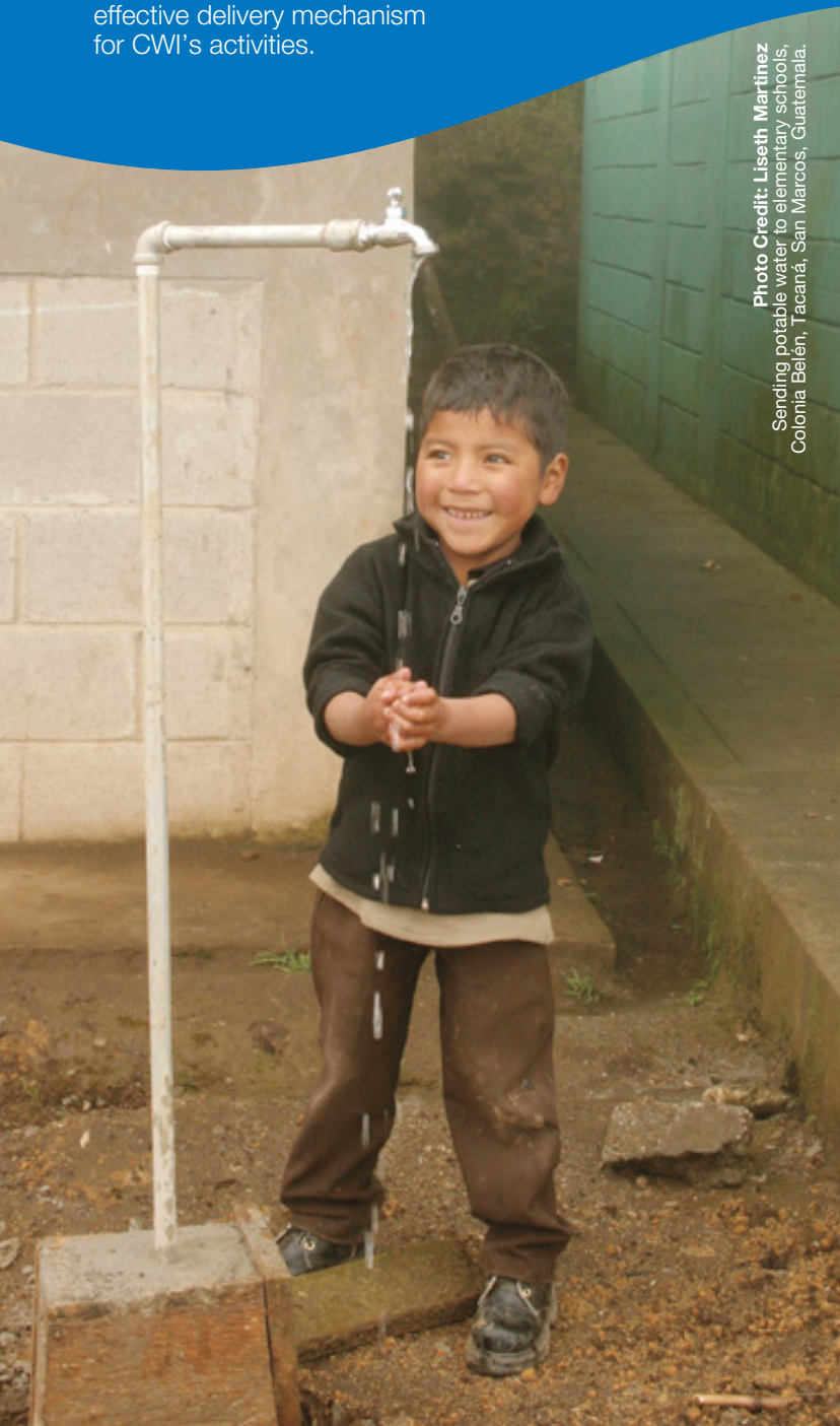
Sending potable water to elementary schools, Colonia Belén, Tacaná, San Marcos, Guatemala.

CWI is implemented through the GEF-SGP, a well-established and proven mechanism for reaching communities and supporting their initiatives. Lunched in 1992, it has channeled nearly $300 million to communities through 10,977 projects around the world. SGP has resulted in direct global environmental benefits, and influenced the formulation of national and local policies on sustainable environmental and development management. Building on its success to date, SGP expects to expand to cover more than 120 developing countries by 2010. The rich community-based experience and networking of GEF-SGP have provided an effective delivery mechanism for CWI's activities.