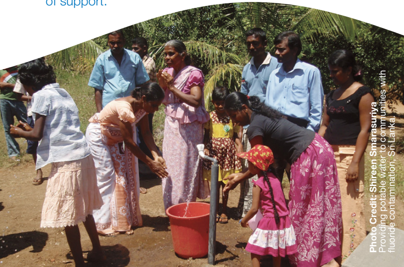
Providing potable water to communities with fluoride contamination, Sri Lanka.

CWI supports decentralized, demand-driven, innovative, low-cost, and community-based water resource management and water supply and sanitation projects in rural areas. It is rooted in the strong belief that local management and community initiatives play a key role in ensuring and sustaining the success of enhancing water supply and sanitation services to poor communities. CWI channels funds directly to local communities in need of support.