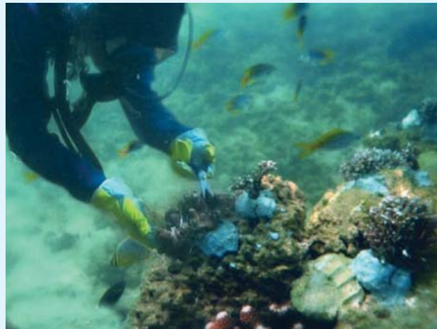
Community coral restoration and replanting (top and above), Sri Lanka