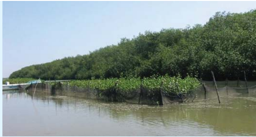
Protection of mangrove swamp