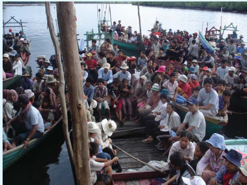
Mangrove and seagrass rehabilitation, protection, and conservation for livelihood improvements, Cambodia