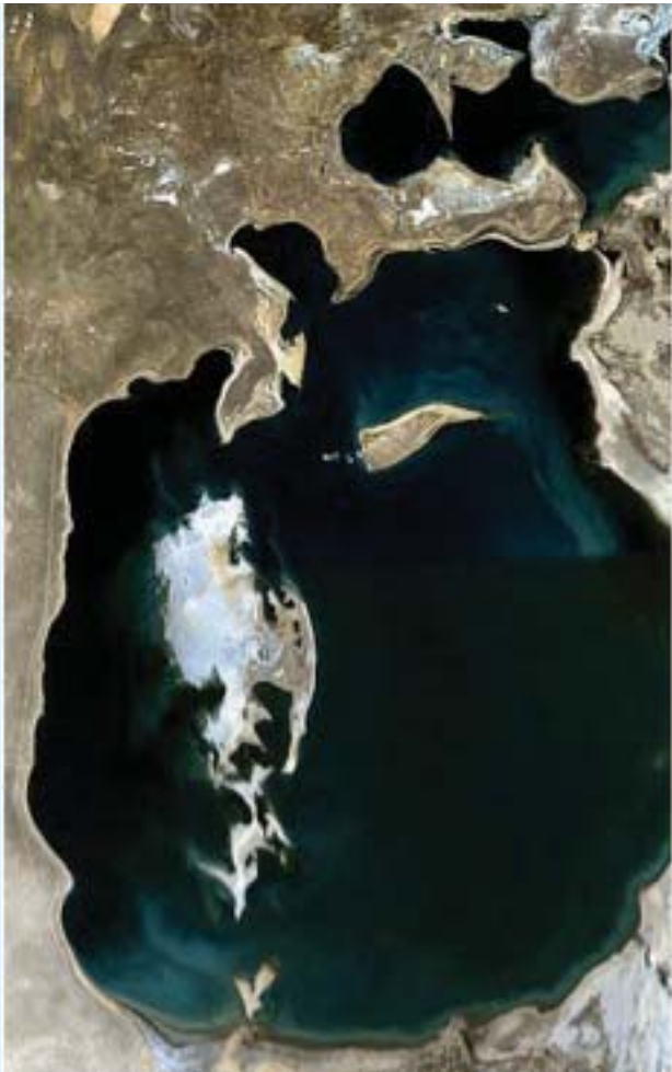
JULY – SEPTEMBER, 1989