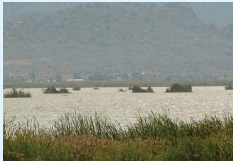
Lake Jipe before and after restoration activities: photos courtesy of SGP-Kenya Before the project (left), Lake Jipe was drying up and inundated with cattails. Rehabilitation through SGP supported projects raised water levels (right).