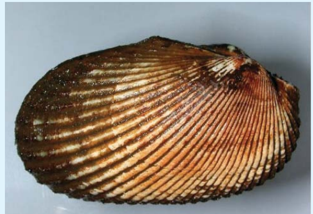
Restored mollusk populations. Both the Anadara Tuberculosa (left) and Anadara Similis (right) populations were controlled by allowing populations to grow in corrals and not be collected until certain sizes were reached: photo from: National Biological Information Infrastructure, Ecuador.