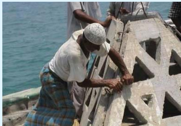
Artificial reef construction — locals poured concrete into models to create triangular pieces (above) which were weighted to the sea floor and later became the perfect habitat for corals (below), photos courtesy of Mr. Sharif Ranjbar.