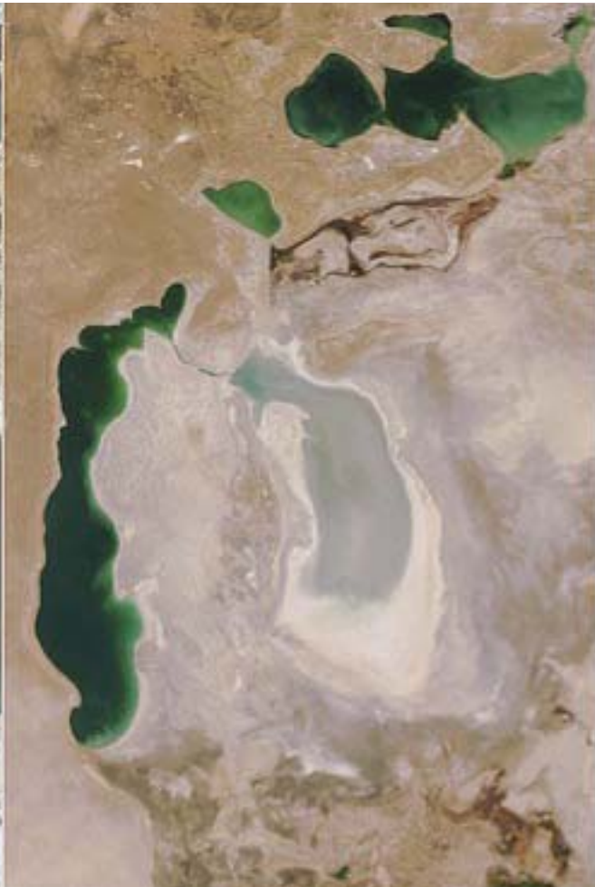
OCTOBER 5, 2008

The Aral Sea