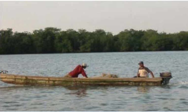
Fishing off Costa Rica Island, photo courtesy of SGP-Ecuador