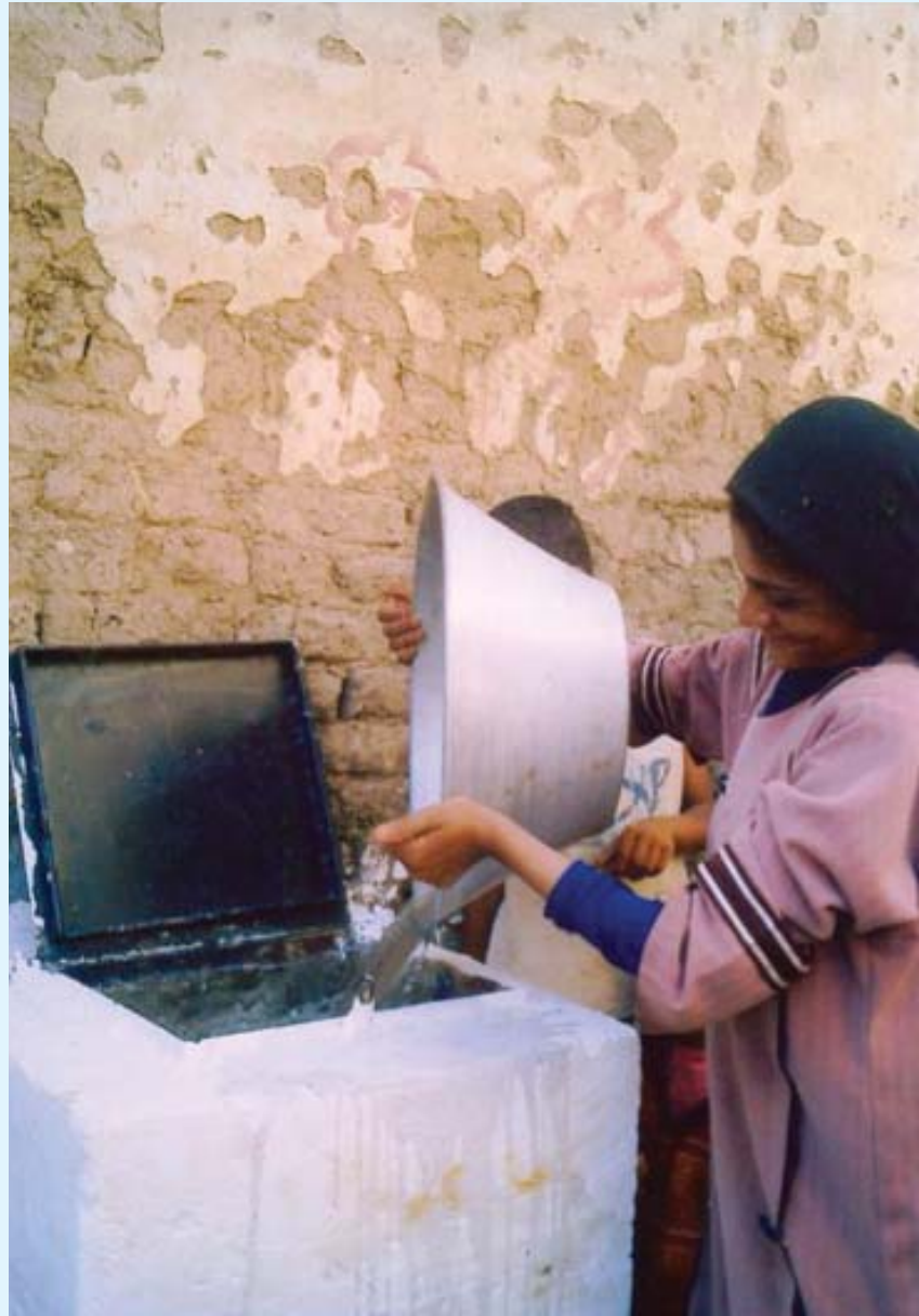
Grey water treatment and protection of fresh water sources, Nile River