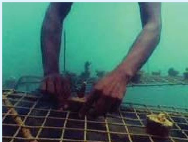
Coral replanting