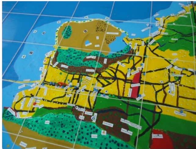
Pins, yarns, paint, and other materials were used to complete the final product

A final ceremony was held to formally hand the completed model to the Tobago House of Assembly, where community stakeholders had the opportunity to describe the impacts that they were likely to encounter as a result of global climate change and the adaptation strategies necessary. Most felt that they were better prepared to deal with the changes that were anticipated in the short and longer term. Overall, the project objectives seemed to have been achieved, however, follow up work will determine the real benefits of this intervention on the communities of Tobago. This will occur in the coming months.