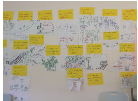
Participatory video storyboard

Community reporting enhances public awareness: The climate change resilience-building efforts of the Caura Valley community took centre stage at this year's UN Day observance, and insight into the work of the project, was featured in the team's participatory video . The video focused on the issue of dumping of garbage in the valley and river, and how this encourages pests. CANARI identified the root problem of this dumping issue, generated ideas for solutions, and captured pertinent footage, and hosted a community screening of the video . One solution to the problem identified by the team is to develop partnerships with the Tunapuna/Piarco Regional Corporation, Ministry of Health and Insect Vector Control Division. The local councillor indicated his desire to use the video in educating other members of the Corporation and other surrounding communities.