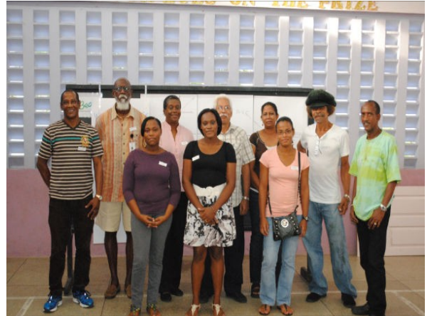
Participants at a BEAT workshop

Art classes, workshops and exhibitions have been held and two murals were completed. The first depicting 'The Washerwoman' and the terrestrial habitat, and the second depicting the marine habitat, both of which are situated at the entrance/exit to the village. The launch of these two pieces of environmental art generated a successful turnout from residents, visitors and special invitees. It has become a landmark of pride, created by local stakeholders.