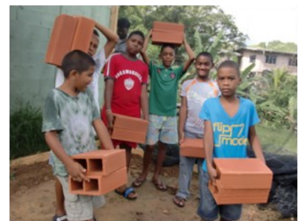
Some of the participants during their daily activities