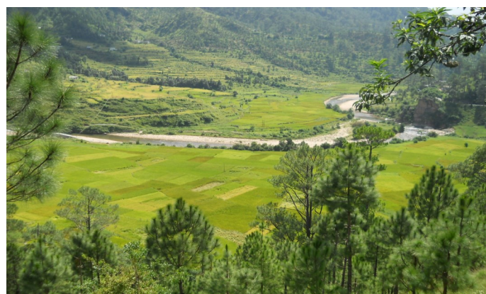
Himalayan State of Uttarakhand