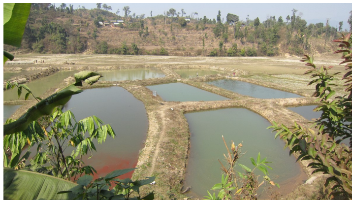
Carp-SIS polyculture, an agro-ecological method in Nepal