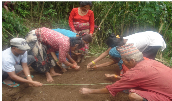
Preparing a seed bed for vegetables

slides and flooding, and land-use practices, such as slash and burn agriculture that increases the threat of forest fires, and causes emissions of greenhouse gases and serious soil erosion, have notably contributed to increasing the ecosystem's risk of further degradation.