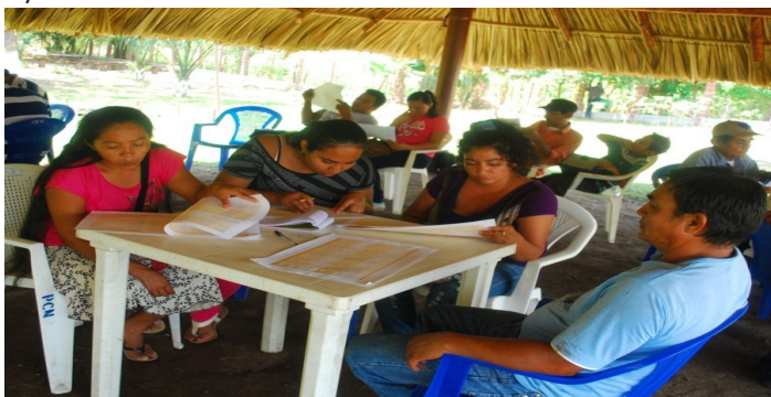
Community members score SEPL indicators

In El Salvador, a landscape-wide baseline assessment was conducted in March 2014 with the objective of assessing current conditions and developing a Landscape Strategy to improve socioecological resilience of the target area. Two members from each of ten target communities in the area participated in workshops along with selected leaders of relevant organizations in the region. In September 2014, the National Steering Committee approved the Landscape Strategy. Potential projects pursuing achievement of landscape outcomes include technical assistance to train leaders for sustainable environmental management, establishing community banks to develop a collection of plant genetic resources for recovering traditional crops, and projects which will promote mixed cropping and agroforestry systems.