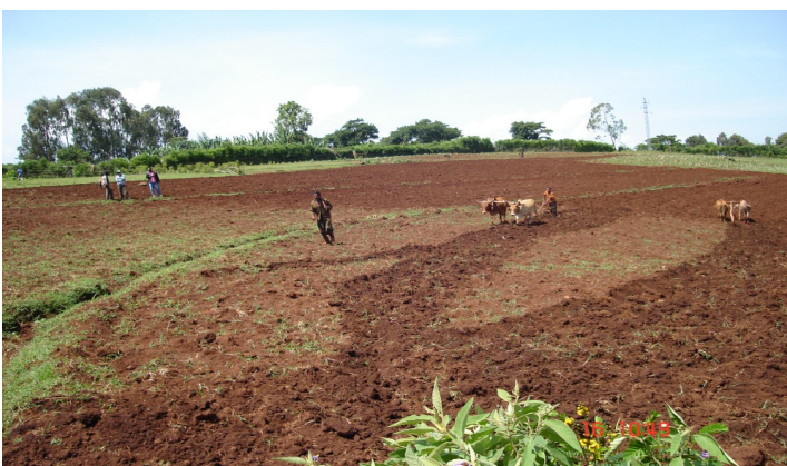
Crop diversification is practiced in Ethiopia

To combat these vulnerabilities and empower communities towards self-sufficiency and improved landscape resilience to various external stressors, COMDEKS projects commonly incorporate agro-ecological techniques in strategies to enhance agricultural production and biodiversity. For example, in Ethiopia, COMDEKS grantee Urgaha Animal Fattening Cooperative aims to raise 100,000 seedlings of native multipurpose species and plant them on degraded areas of the ecosystem such as gullies, landslides and degraded riverbanks, along physical soil and water conservation structures, and as components of agro-forestry systems to restore ecosystem services in the region and become a source of income for farmers in the region.