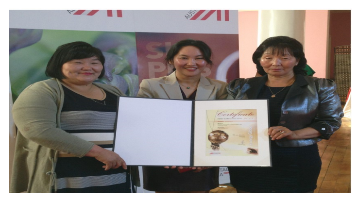
Accepting the Energy Globe Certificate.

With technical assistance from Hiroshima University, the project introduced an alternative approach to construct greener and more reliable solutions for local herders and farmers, along with onsite training and capacity building.