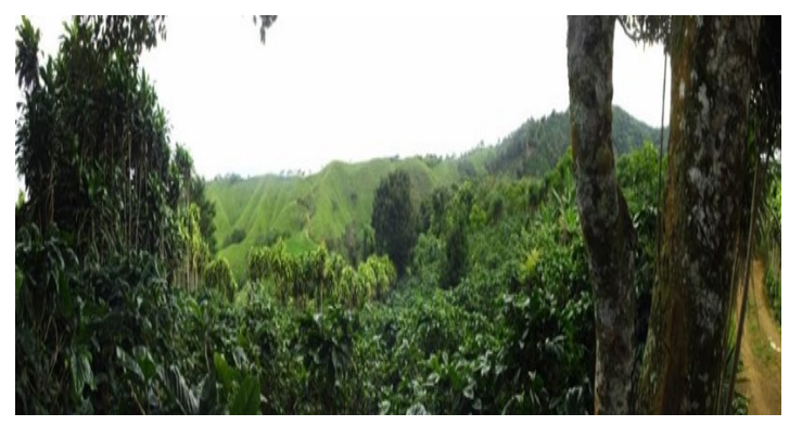
Panoramic view of the Jesus Maria watershed.