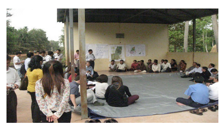
Consultation before devising landscape strategy.