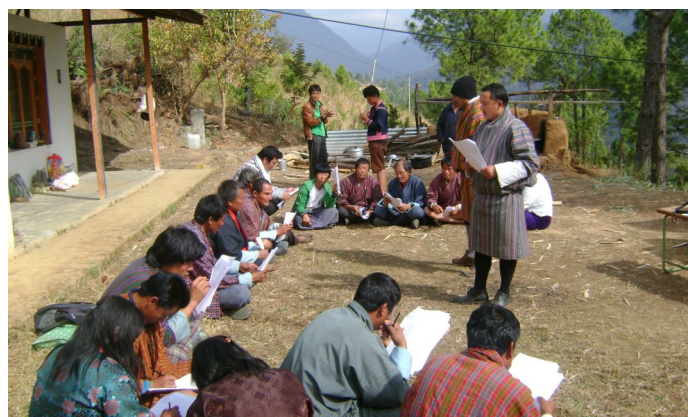
Ex-post baseline assessment at the Gamri Landscape

larger geographic areas and over many communities simultaneously, and how these efforts can be linked to national development and land use planning to magnify their effects.