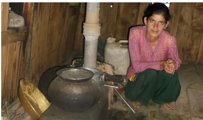
Smokeless cook stove