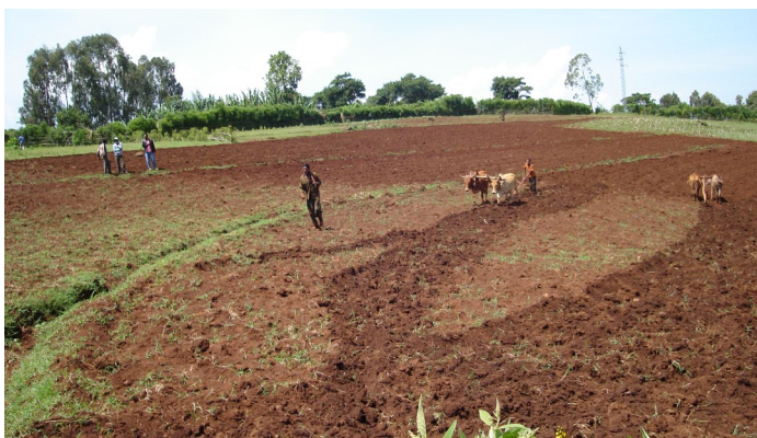
Farming activity to diversify crop production