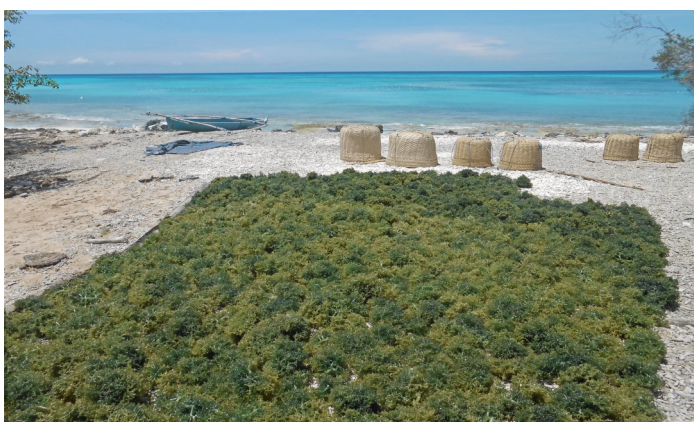
Sustainable seaweed farming