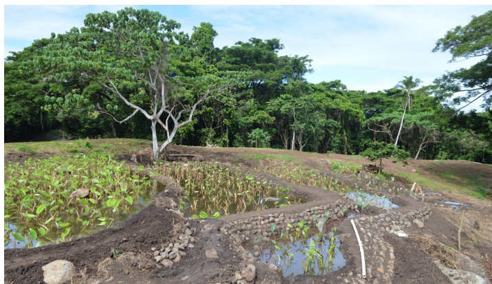
Rehabilitated taro terraces

Centuries ago, ancient Fijian tribes established water taro terraces when water taro was a major food source, and abandoned terraces of this sort are found throughout the high islands in the central Pacific. They have also been an integral part of the Natewa National Park on the island of Vanua Levu, which comprises a wide variety of habitats such as mountain and coastal forests, shrub lands, coastal headlands, streams, and wetlands. Many of these support sensitive and threatened animal and plant species. Prior to COMDEKS-supported activities, this area has never been under any form of biodiversity management. Hence, there is enormous unrealized potential for the Natewa National Park to contribute to biodiversity conservation on a national and regional scale, in line with the park's aim to create a positive balance between nature conservation and economic development.