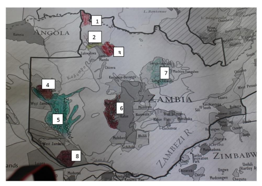
Figure 1: Representation of ICCAs in the Western and Northwestern Provinces